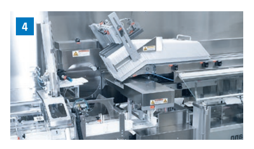
The wallets are transferred in stacks of seven to the Uhlmann C 200 cartoner.