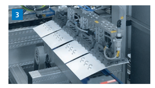
A completely newly developed folding system allows many axis movements and can handle the enormous variety of blister formats.